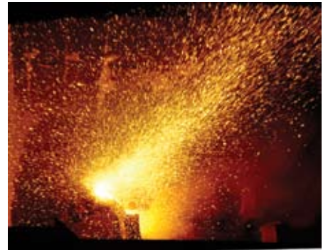
Alumina bubbles are used in several applications in the refractories market.

The insulating firebrick (IFB) that contain high-alumina bubbles are often used as the working lining in ceramic kilns, but are used mainly as backup linings in gasifiers for coal and petroleum coke, gas/oil (with heavy residue feed stock), and industrial waste. These brick are also used in hazardous waste and fluorine processing incinerators, hydrogen generators, auto thermal reactors for methanol production, and ammonia reformers.